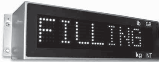
SURVIVOR LaserLight M-Series 8-character display 12-character display also available