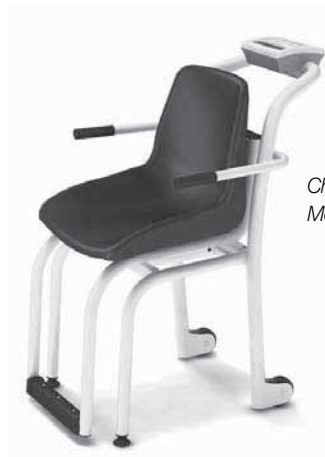
Chair Scale Model 540-10-1