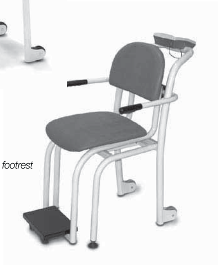
Premium Chair Scale with footrest Model 540-10-2