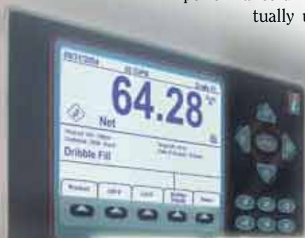
The 920i features a large display screen, configured with icons, prompts, messages, soft keys, and selectable character sizes.

The 920i is Rice Lake's signature HMI digital weight indicator controller and is incorporated into all Series 10 filling stations. Its robust processing power provides ultimate control for fast, accurate filling. Designed for ease-of-use, the 920i combines performance-driven circuitry and intuitive features to give you virtually unlimited power while maintaining user-friendly operation. With up to 14MB of optional memory, the 920i gives you the power to manage critical upstream and downstream information specific to your filling needs.