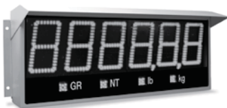
LaserLight 6 in digit shown with visor