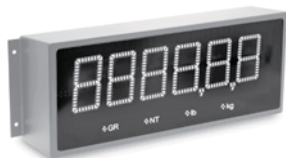
LaserLight 4 in digit