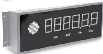
LaserLight 4 in digit with stop and go lights