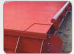
SURVIVOR® ATV Heavy- and super-duty top access portables