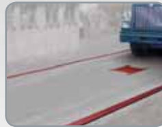
SURVIVOR® PT Pit-type concrete or steel deck scales