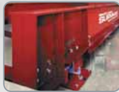
SURVIVOR® SR Extreme-duty, low profile concrete or steel deck siderail scales