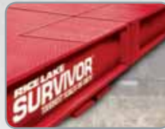
SURVIVOR® OTR Top access, low profile concrete or steel deck scales