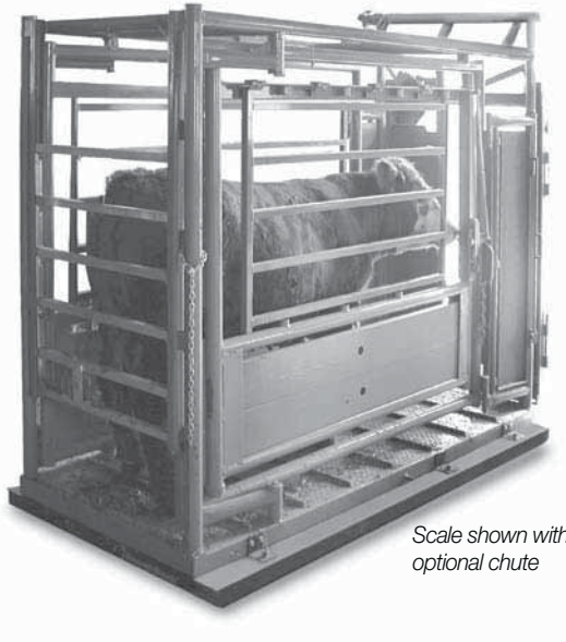
Scale shown with optional chute