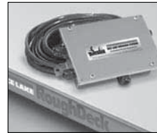
Remote TuffSeal JB4SS stainless steel NEMA 4X junction box with 20 ft of hostile environment load cell cable