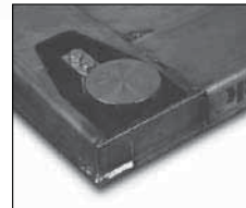
The load cells are recessed within the channel and protected on all sides. SUREFOOT supports provide a superior load introduction surface, reducing extraneous forces which might affect scale accuracy.