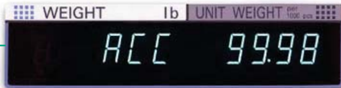
The DC-190 lets you know the accuracy percentage of unit weights based on scale capacity.