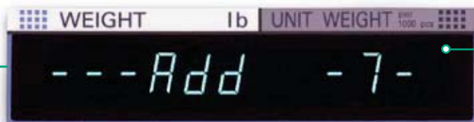
Proper sampling is critical to accurate results. The DC-190 helps operators get it right every time.