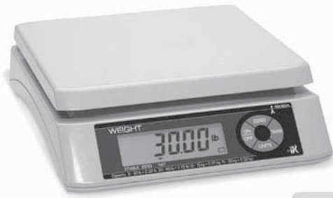
iPC with dual display